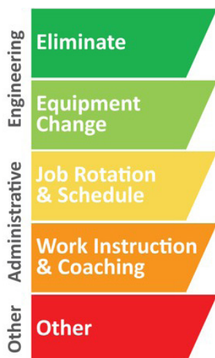
Figure 1: Hierarchy of Controls for MSDs

Humantech's hierarchy of controls model for MSD risks is a refinement based on current models of leading agencies and institutions. Humantech's position is that there are five general levels of controls. These reflect the current research on effectiveness of MSD controls, providing a focused model from which to plan and determine workplace ergonomic improvements. The descriptions are simple, intuitive, and specific, to improve communication, understanding, and application by employers in a wide range of industries.